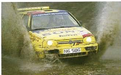
Alister McRae makes a splash on his way to British Championship victory for Volkswagen

Since its launch in 1976 the Volkswagen Golf GTI has not only been establishing sales records around the globe, it's been rewriting the motor sport record books. The car which created the 'hot hatchback' class and spawned a host of imitations has enjoyed a race and rally career par excellence .